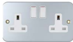
MC13A2G 13A 2Gang Switch Socket