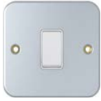
MC1G2W 10A 1Gang 2 Way Switch