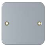
MC1BP 3x3 Blank Plate