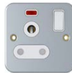
MC15A1G 15A 1Gang Switch Socket