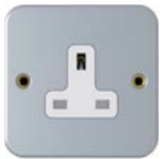
MC13A1G 13A 1Gang Switch Socket