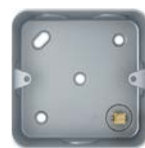
MC1GB 3x3 Metal Clad Box