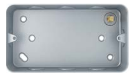
MC2GB 3x6 Metal Clad Box