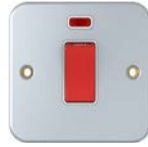
MC45DPN 45A 1Gang DP Switch