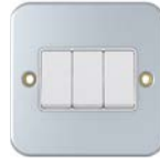
MC3G2W 10A 3Gang 2 Way Switch