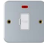
MCBAFCU 13A Unswitched Fused Spur Outlet