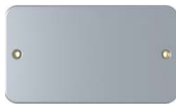
MC2BP 3x6 Blank Plate