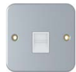
MC16RJ45 1Gang RJ45 Data Socket MC1GTVS 1Gang RJ11 Tele Socket