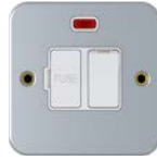
MC13FCUS 13A 1Gang Switched Fused Spur Outlet