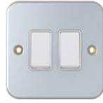
MC2G2W 10A 2Gang 2 Way Switch