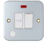
MC20DNF 20A 1Gang DP Switched Fused Flex Outlet