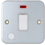
MC20DPN 20A 1Gang DP Switch