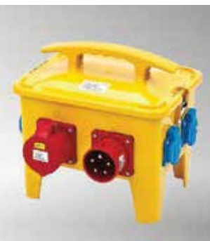
Item No.A12MB02-2 IP44