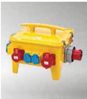
Item No.A24MB06-2 IP44