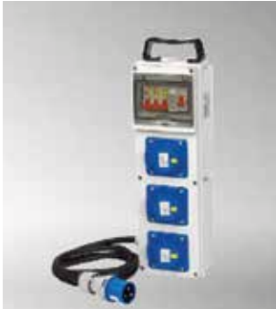
Item No.A06MA01-4 IP44