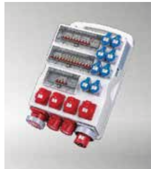
Item No.A38MB02-2 IP44