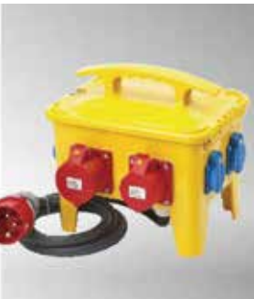
Item No.A12MB01-4 IP44