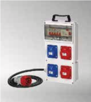
Item No.A10MB02-4 IP44