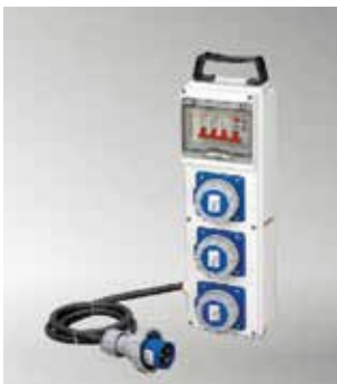
Item No.A06MA07-4 IP55