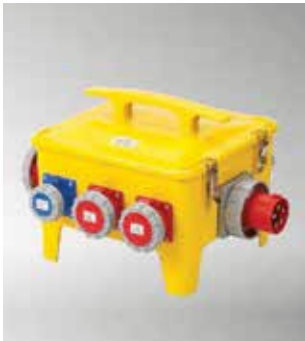
Item No.A24MB01-2 IP44