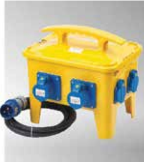
Item No.A12MB03-4 IP44