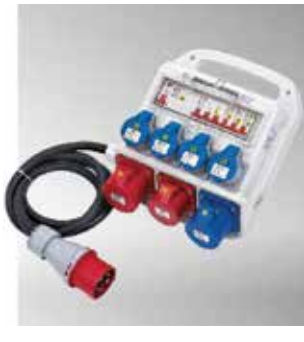
Item No.B11MA46-4 IP44