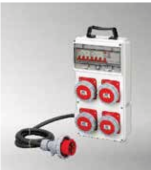
Item No.A10MC04-4 IP55