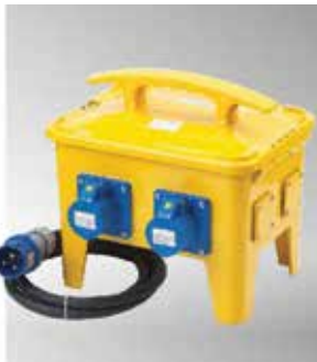
Item No.A12MB06-4 IP44