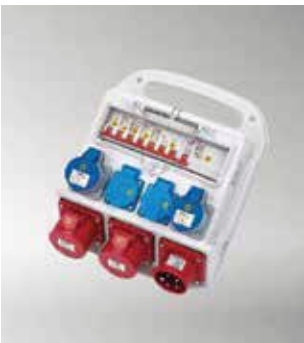
Item No.B11MA48-2 IP44