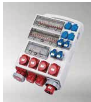
Item No.A38MB08-2 IP44