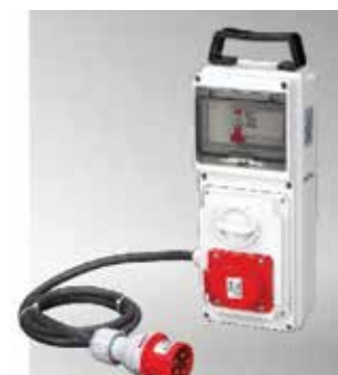
Item No.B06MA06-4 IP44