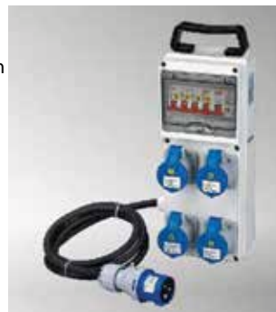
Item No.B06MD04-4 IP44