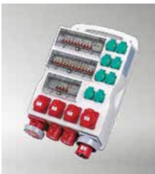
Item No.A38MB07-2 IP44