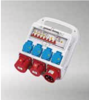
Item No.B11MA10-2 IP44