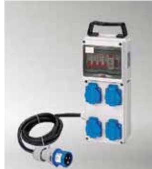
Item No.B06MD01-4 IP44