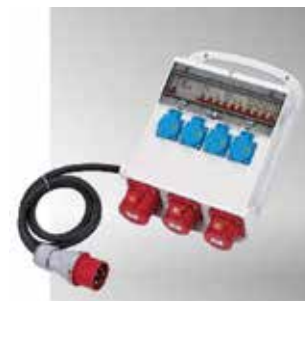
Item No.B14MA04-4 IP44