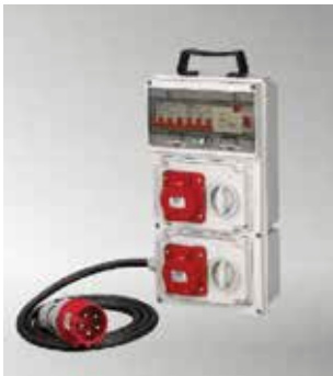
Item No.A10MA06-4 IP44