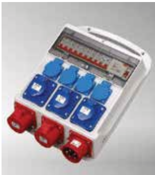
Item No.B14MC01-2 IP44