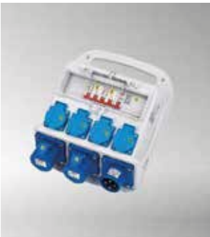
Item No.B11MA21-2 IP44