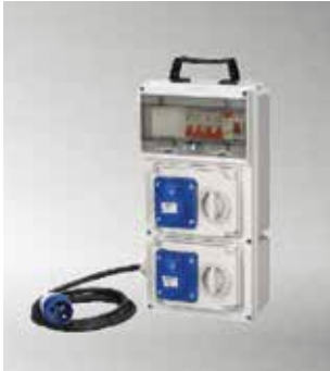
Item No.A10MA01-4 IP44