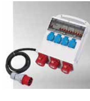
Item No.B14MA02-4 IP44