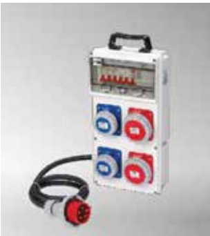
Item No.A10MB05-4 IP55