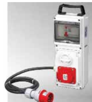
Item No.B06MA03-4 IP44