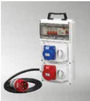
Item No.A10MA07-4 IP44