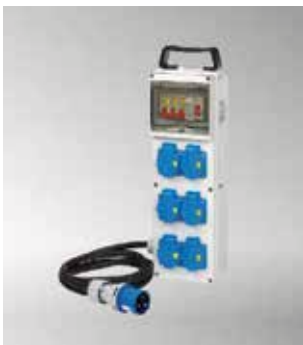
Item No.A06MB01-4 IP44