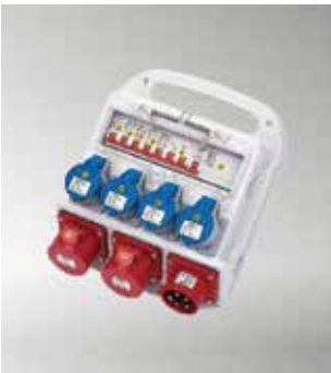
Item No.B11MA47-2 IP44