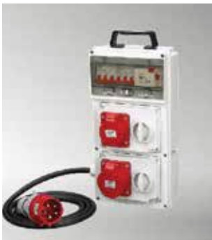
Item No.A10MA09-4 IP44