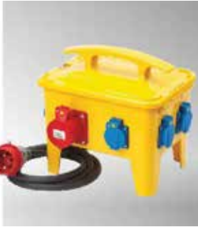
Item No.A12MA01-4 IP44