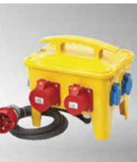
Item No.A12MB04-4 IP44