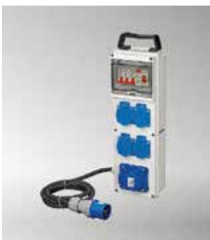
Item No.A06MJ01-4 IP44