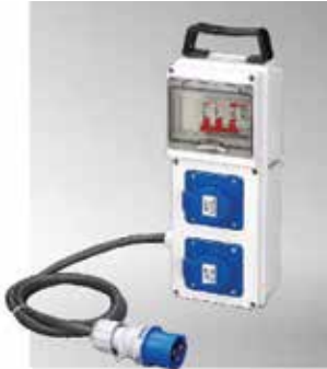
Item No.B06MB01-4 IP44