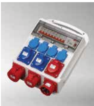
Item No.B14MC05-2 IP44