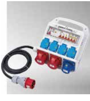
Item No.B11MA03-4 IP44