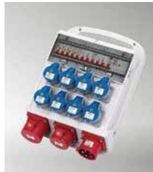
Item No.B14MB20-2 IP44