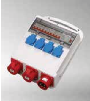
Item No.B14MA01-2 IP44