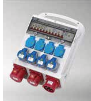
Item No.B14MB19-2 IP44