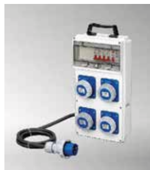
Item No.A10MB04-4 IP55