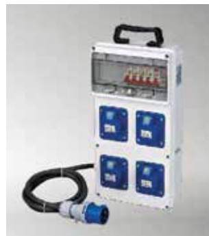
Item No.A10MB01-4 IP44