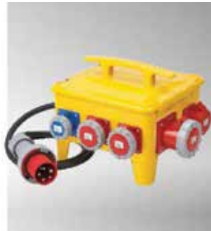
Item No.A24MD01-4 IP65