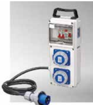
Item No.B06MB04-4 IP55