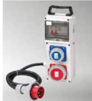
Item No.B06MC02-4 IP55