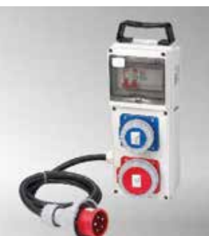
Item No.B06MB05-4 IP55