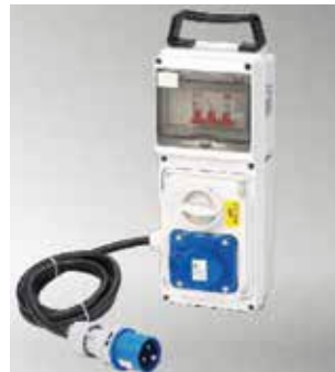
Item No.B06MA01-4 IP44