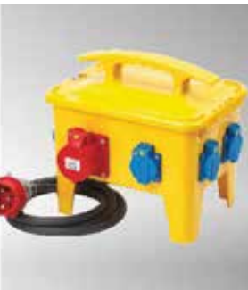
Item No.A12MA03-4 IP44