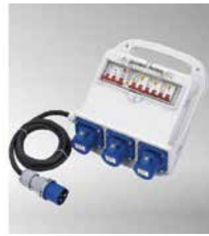
Item No.B11MD01-4 IP44