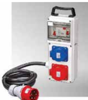
Item No.B06MB02-4 IP44