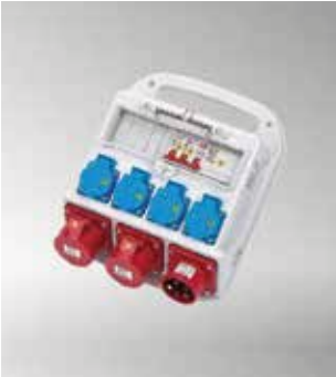
Item No.B11MA24-2 IP44