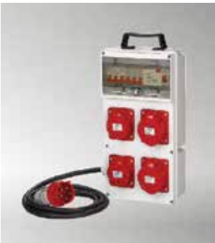
Item No.A10MC02-4 IP44