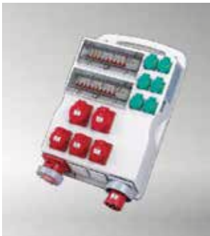
Item No.A28MA07-2 IP44