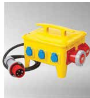
Item No.A24MC01-4 IP44