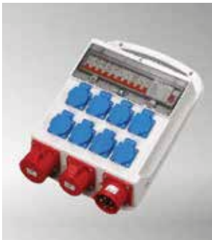
Item No.B14MB01-2 IP44